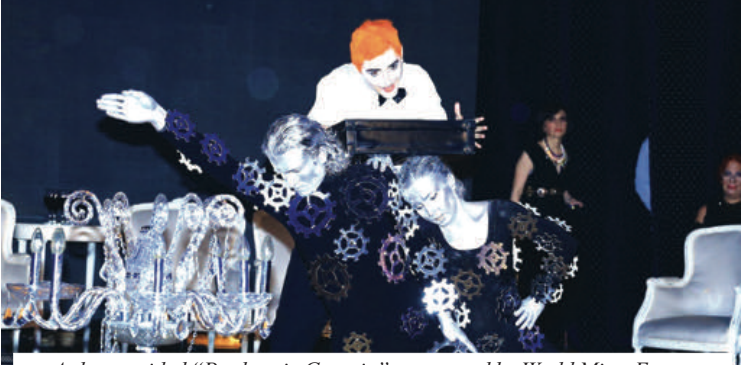
A show entitled "Produce in Georgia" was staged by World Mime Event Amiran Shalikashvili Pantomime Theatre

Week, Svabodnaya Gruzia, Versia, Rezonansi, Kviris Palitra, Kartuli Sitkva. Tbiliselebi and Forbes Georgia.